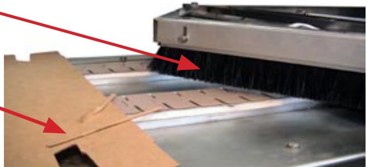
Figure 1.2 - Tray with Debris moving towards Brush