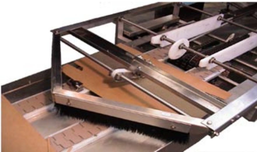
Figure 1.1 - 'V'-Shaped Debris Brush

UPGRADE FOR: Model 296 Continuum Traypacker