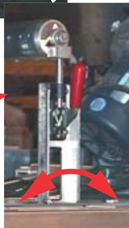
Figure 1.2 - Close-up of locked mandrel support