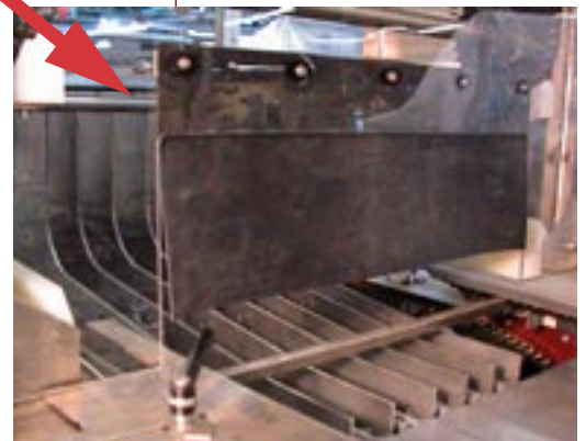
Figure 1.2 -

Call the Standard-Knapp Sales Department at 1-800-628-9565 ext. 239 for ordering information.