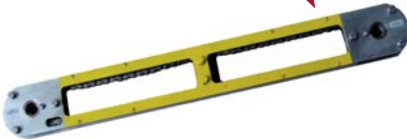
Figure 1.2 - Close-up of Chain Cartridge