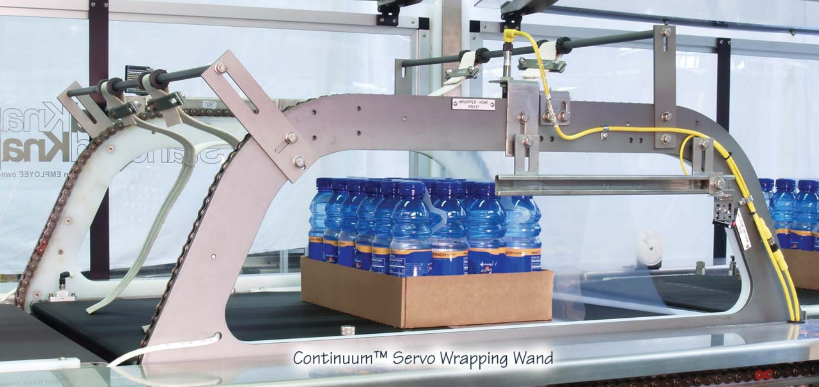
Continuum™ Servo Wrapping Wand